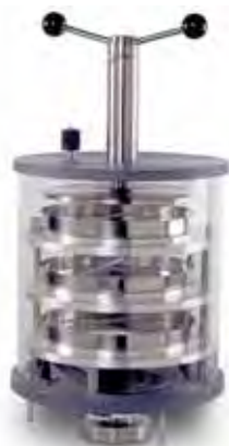
Large capacity stoppering chamber