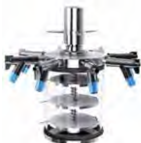
Standard stoppering chamber with 8 port manifold