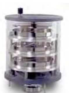
Large capacity chamber