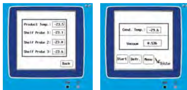
LyoQuest control panel screens

Based on more than 40 years of experience, Telstar introduces the LyoQuest as state of the art in performance and process control. The unit was specifically developed for basic research in biotechnology and scientific institutes.