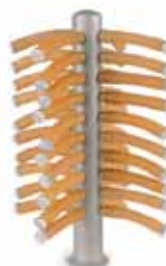
40 port manifold