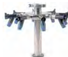
8 port manifold