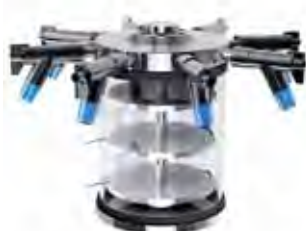
Standard chamber with 8 port manifold