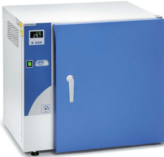
Models Conterm, Part No. 2000250, 2000251 and 2000253.

FEATURES, CONTROL PANEL, SAFETY, STANDARD AND ACCESSORIES (see pages 138 and 139).