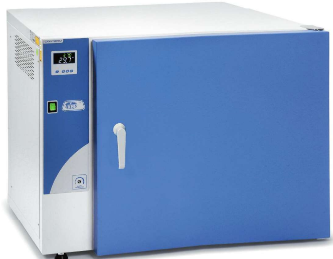
Model Conterm type Poupinel, Part No. 2000252 and 2000254.